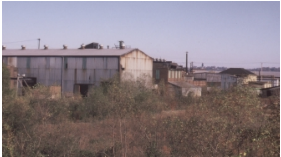
Regional Planning Agency, Chattanooga